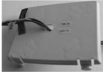
Fig. A (J-Box)